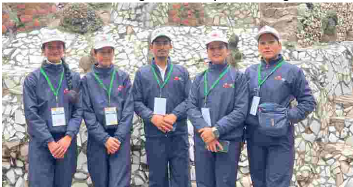
Border Area Youth Exchange Programme at Chandigarh