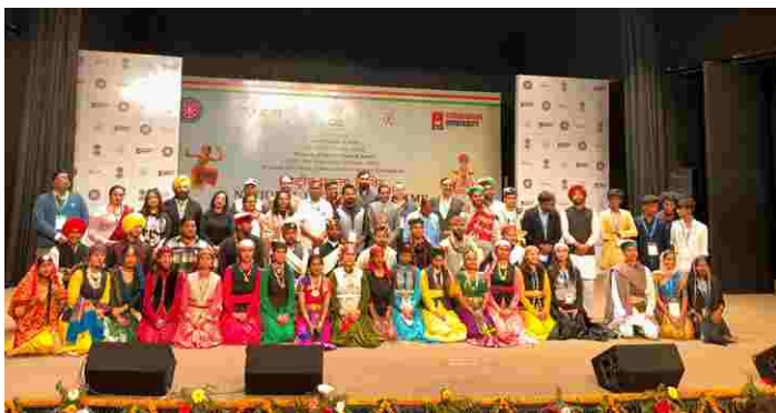
National Integration Camp at Chandigarh