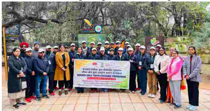
Border Area Youth Exchange Programme at Chandigarh