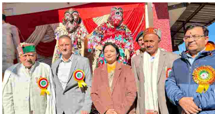
DC Nahan as Chief Guest District Level Youth Festival