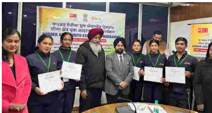
Youth Exchange Programme at Chandigarh